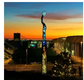
Burnt Matchstick in Civic Center Park at Newport Beach, California, 2017